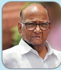
Shri Sharad Pawar President, Cogen India